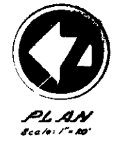
PLAN Scale: 1"=20'